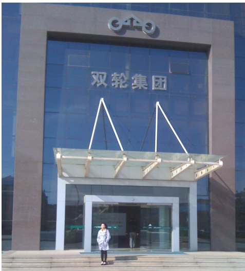
SSG's office in Weihai City, Shandong.

In April 2010, Intech Pumps (Asia Pacific) signed a partnership agreement with Shandong Shuanglun Group Co, Ltd (SSG) , a leading pump manufacturer in China founded in 1952.